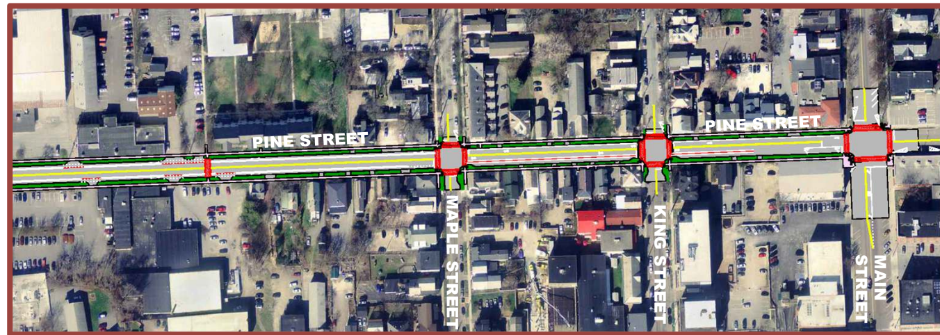
Champlain Parkway Construction Limits

INITIAL CONTRACT: Rehabilitation of Pine St. from Lakeside Ave. to Kilburn St.